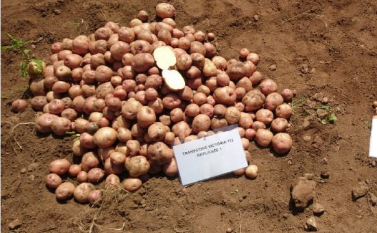
Yield gain of 3R Victoria - Potato harvest from the transgenic potato 3R Victoria (left) and the conventional potato Victoria (right) grown without fungicide at Kachwekano research station in 2019 in Uganda.

recommended by the OECD. Moisture, sugars (especially reducing sugars), vitamin C, ash, protein, and glycoalkaloid contents were mostly identical and all values were within the range reported in the literature for potato tubers (OECD 2015; AFSI 2019).